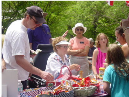
scene from last year's party

As with last year's popular bash, barbecued hamburgers and hot dogs, snacks and drinks will be available to purchase from 11:30 to 1:30. To make sure their guestimate of the amount of food and beverages needed to make everybody happy is semi-