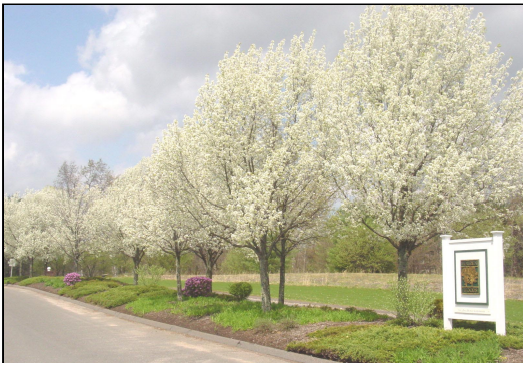
Any day now . . . . .